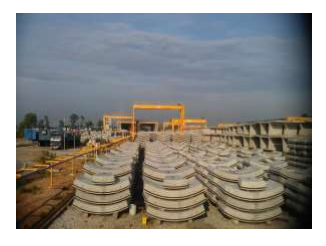
Precast Tunnel Lining Segments